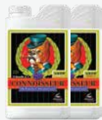
pH Perfect® Connoisseur Grow A&B