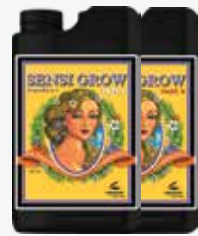
pH Perfect® Sensi Grow A&B