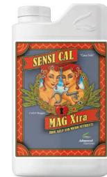
Sensi Cal-Mag Xtra®