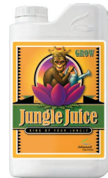
Jungle Juice™ Grow