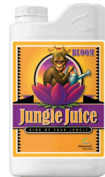
Jungle Juice™ Bloom