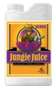
Jungle Juice™ Bloom