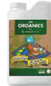
OG Organics® Big Mike's® OG Tea