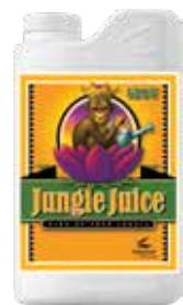
Jungle Juice™ Grow