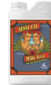
Sensi Cal- Mag Xtra®