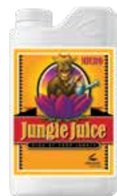
Jungle Juice™ Micro