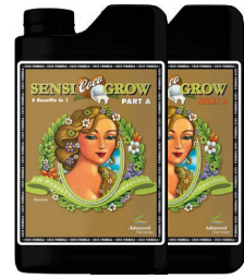
pH Perfect® Sensi Coco Grow A&B