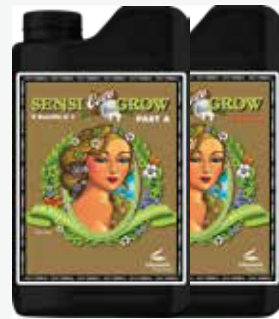
pH Perfect® Sensi Coco Grow A&B