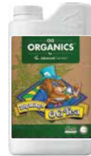
OG Organics® Big Mike's® OG Tea