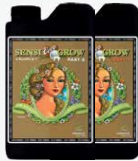
pH Perfect® Sensi Grow Coco A&B