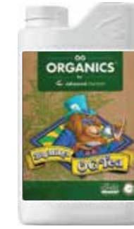
OG Organics® Big Mike's® OG Tea