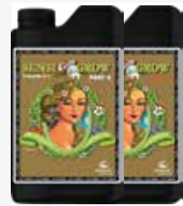
pH Perfect® Sensi Coco Grow A&B