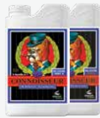
pH Perfect® Connoisseur Grow A & B